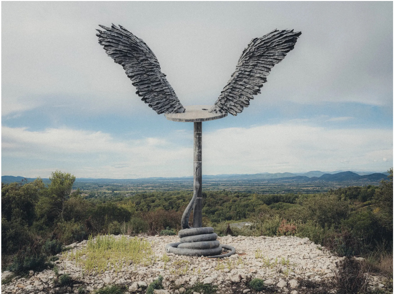
"Ra," a 2018 work by Anselm Kiefer, on a hill overlooking the La Ribaute estate in southern France.

Featuring Anselm Kiefer's La Ribaute in Barjac