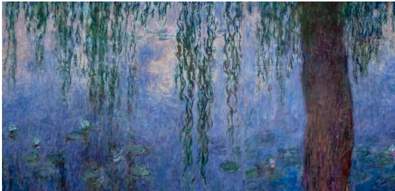
Claude Monet, Detail of The Water Lilies: Morning With Willows